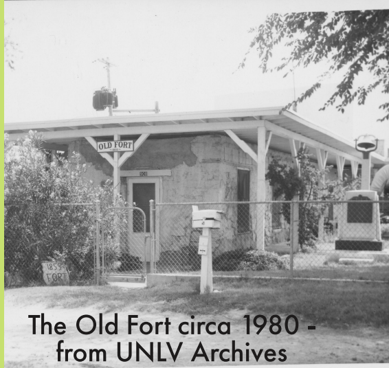
The Old Fort circa 1980

The Friends of the Fort marks its 40th year of service in 2023!! Since its creation, countless volunteers have pledged their time and support of the Old Las Vegas Mormon Fort. We are grateful for the aid and friendship of all our members.